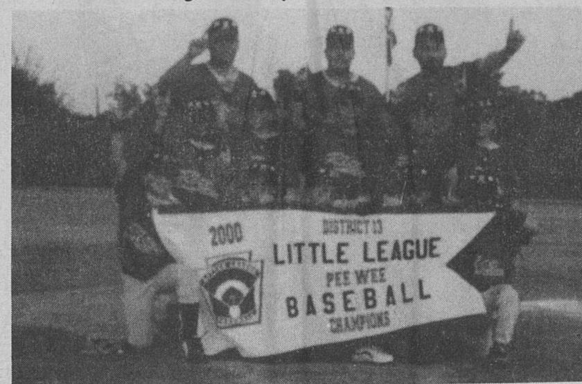
The Rice Pee Wee All-Stars and their coaches proudly display their Championship Banner.

Rice Pee Wee All-Stars made history. These young players may not totally understand the mark they've made. So many other Rice All-Star teams have gone before them and played but never has an All-Star team come home with a District Championship.